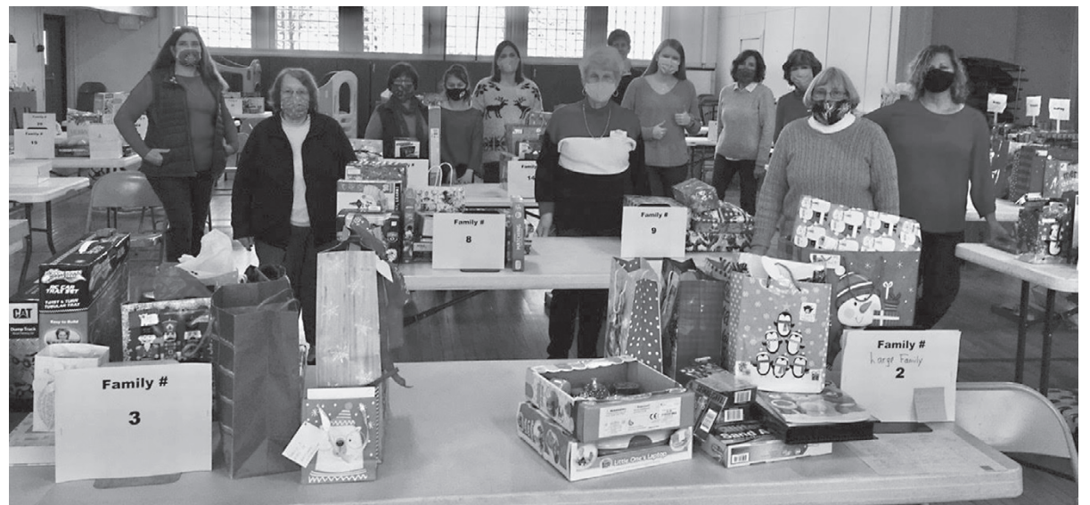
Dozens of volunteers team up to make River Region campaign 'a great success'